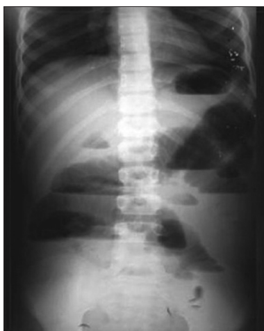
Figure 1: Plain X-ray abdomen erect posterior-anterior view shows multiple air-fluid levels with features of small bowel obstruction. No free air under the diaphragm. Fat plane psoas shadow are normal

A rapid sequence induction (RSI) with a minimal dose of thiopentone and adequate succinylcholine with cricoid pressure is used by many. Any untoward event during RSI may lead to aspiration and concomitant lung damage [Figure 2]. Etomidate as induction agent can be useful in hemodynamically unstable patients. Air, O 2 , the agent is better than using nitrous oxide because of its propensity of the latter to increase closed air spaces and complicate distension. [24,25] More commonly, it will cause difficulties with abdominal closure at the conclusion of surgery. A drastic hypotension after abdominal opening may ensue in patients where IAH has contributed significantly to mesenteric vascular compromise. Administration of a high concentration of inspired oxygen