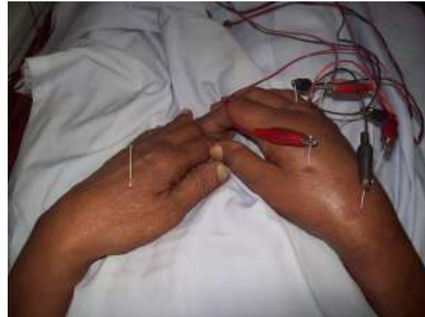
Fig 1 showing acupuncture needles in situ

the machine was standardized prior. A minimal tingling sensation felt at the site of stimulation was the target which was achieved in all cases. Any reduction in VAS of more than 2 was considered significant. We measured the difference in circumference between the affected and unaffected limb at the level of wrist or ankle joint; once before start of treatment and then two weeks after treatment. We then calculated the percentage of reduction of oedema based on the difference between the two metric values. Any reduction of more than 25 % was taken as significant. Any injury, bleeding and adverse events were monitored and noted. A long term follow up for three months with an advice to continue minimal household physiotherapy was done to substantiate our findings. An achievement of full range of painless movement of the fingers was taken as complete motor recovery.